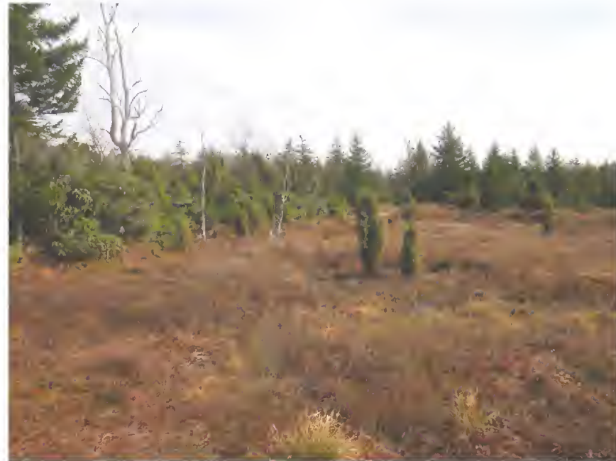
Fig. 4. Habitat, var. communis , Otter Creek, WV